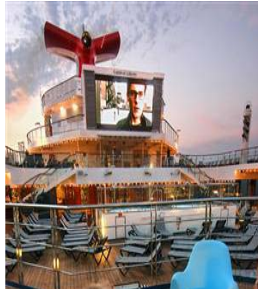
The Carnival Liberty - Lido Deck - BIG TV! - This was one of my favorite features!! You can lounge and watch TV, or a movie, or a Sports game. The white "box" in the center of the photo contains 2 of the whirlpools and directly in front of that is the pool.

It's a great little perk to the Lido deck. (Lido deck will be discussed in another story) While you're up on deck either sunbathing or eating, you can have a seat and watch whatever is on the Big TV. When you're without communication (all of us except Chris that is) from the rest of the world, I think it's neat to eat your omelette and watch the news. Or in the evenings, they play a couple of movies or sometimes a sports game.