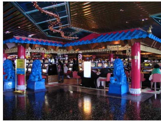
This is the Casino on the Carnival Victory. It was gorgeous! There are card tables, and slots- a lot to keep you busy!

What I liked best about Carnivals' shows is that while they are extremely well choreographed, the dancers are also having fun! That really makes the show come alive. It's one thing to be able to execute a perfect routine, but to do it while having a blast kicks up the whole entertainment value.