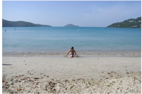
Magen's Bay - This is from our visit in 2007. The pictures just do not do this place justice. The colors are amazing and I'll have a better camera with me this time to capture the colors and the memories that we make.

Lido is more casual dining. We usually go there for breakfast, lunch, and snacks 1-5. For dinner, we prefer the formal dining room. The midnight buffets are all up on Lido. It's amazing to see the artistry the can do with food. The deli is on this deck as well and makes a killer grilled cheese, turkey sandwich and reubens. And they have potato chips. I think it's one